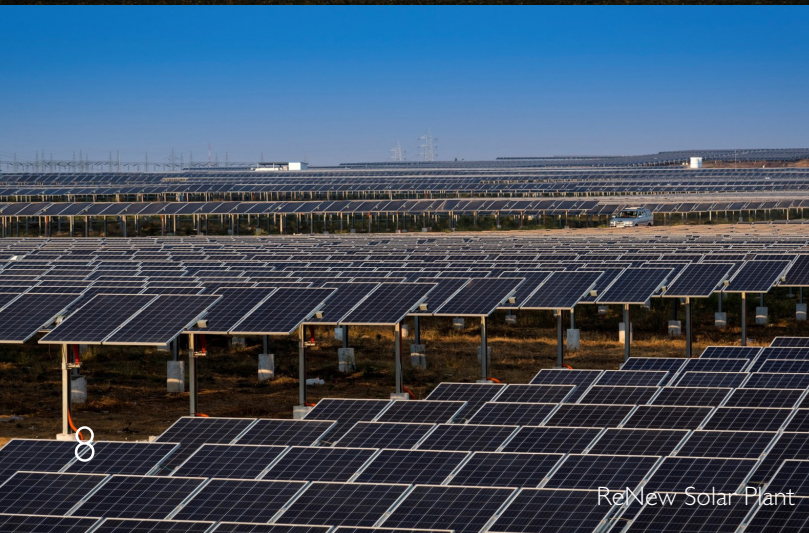
ReNew Solar Plant